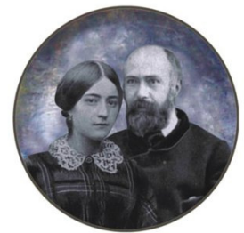
Blessed Marie-Azélie Guérin Martin 1831-1877